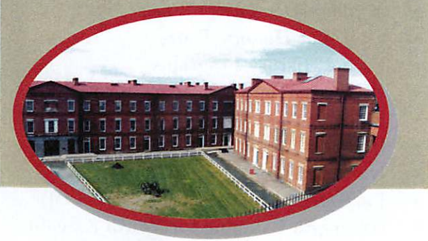
Behind the Scenes Tour: Tour areas of the Fort not open to the public, learn about our restoration & preservation process. Weekends only. $5.00 Per Person